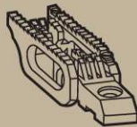
FEED DOG 톱니